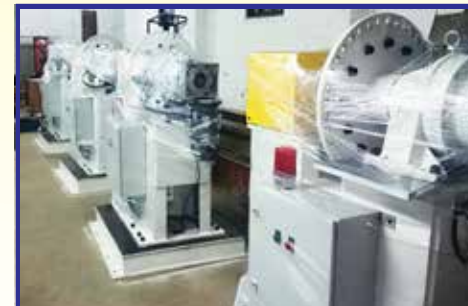
Positioner Assembly Line