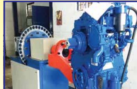
Engine Assembly Positioner