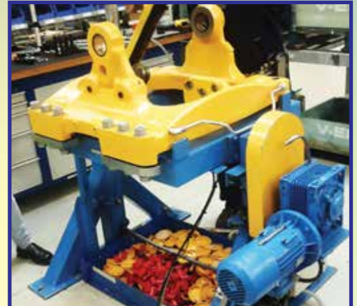
Swing Carriage Stand