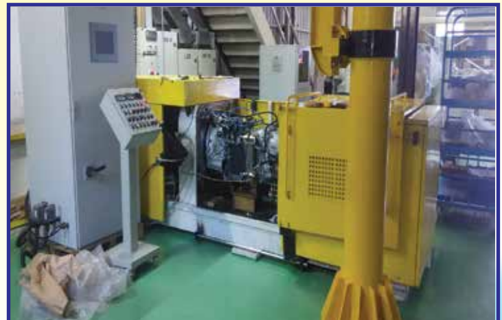
Gear Box Test Rig