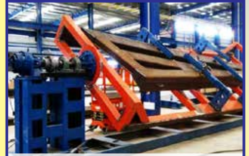
Side Full Welding Positioner