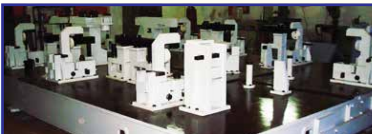
Tack Welding Fixtures