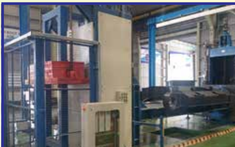
Roller Assembly Positioner