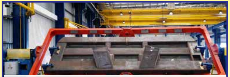
Full Welding Positioner