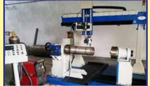
Cross-Beam Welding SPM