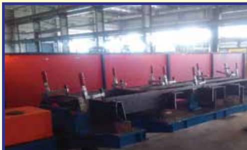
Deck Welding Positioner