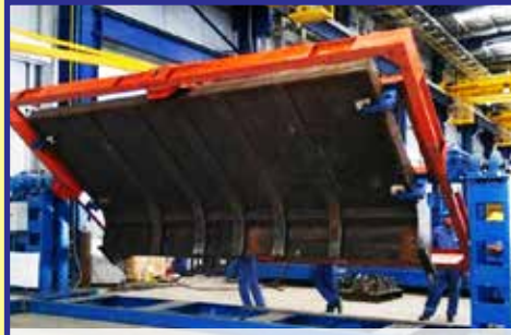
Canopy Full Welding Positioner