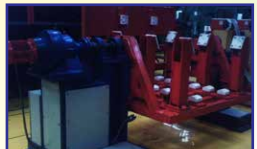
Turn Over Stand