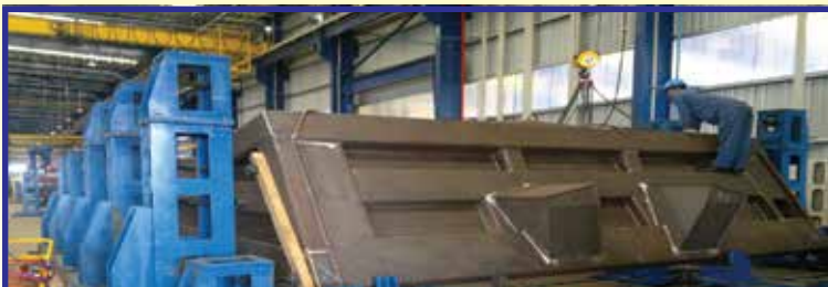
Dumper Body TWF