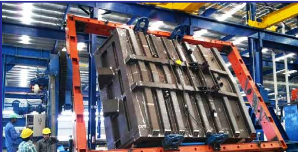
Dumper Body Full Welding Positioner