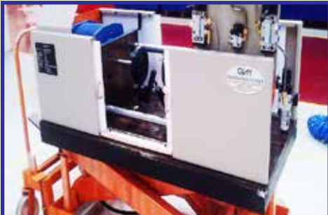
Valve Leak Testing Machine