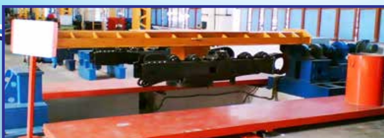
Roller Assembly Positioner