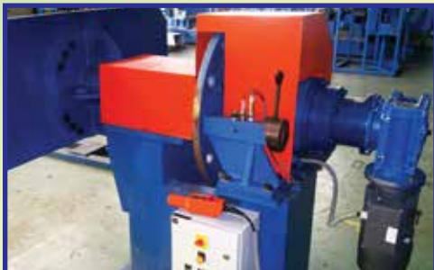
Main Beam Welding Positioner