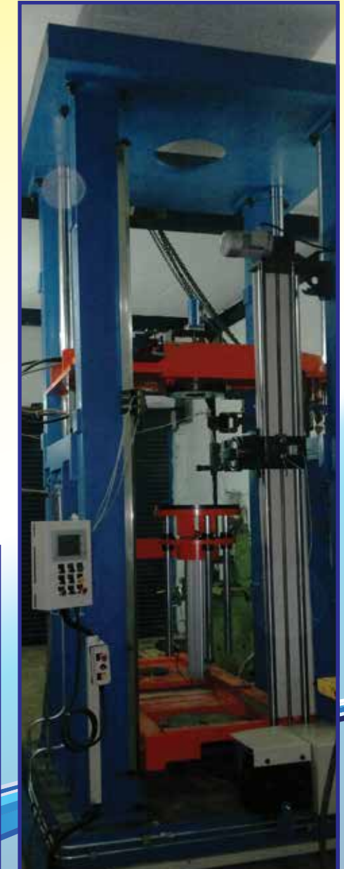
Spring Can Circular Servo Welding SPM