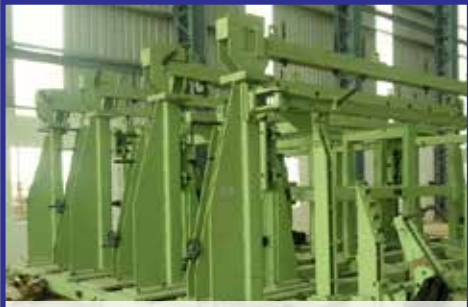
Dumper Body TWF