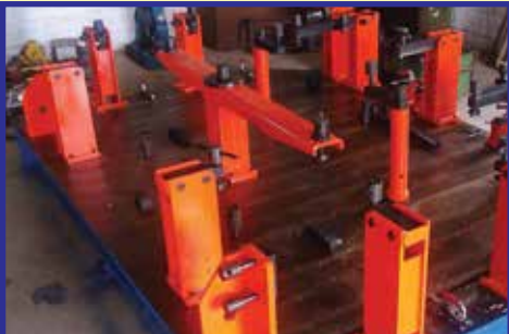
Counter Weight TWF